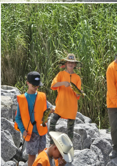
By Nikki McGoldrick, FSCA, All Rights Reserved