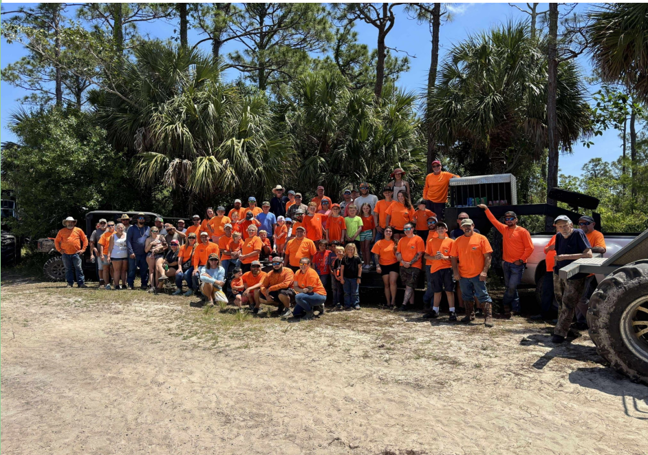
Corbett Clean Up 2025