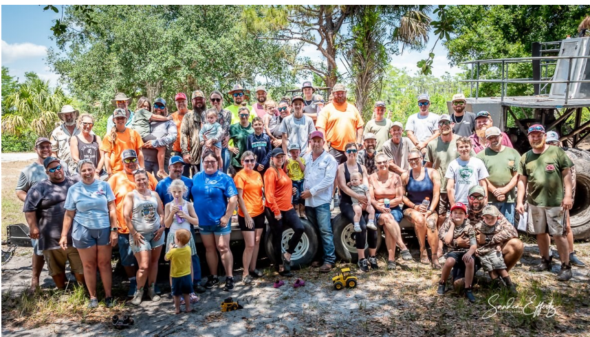
Annual Corbett Area Clean-up