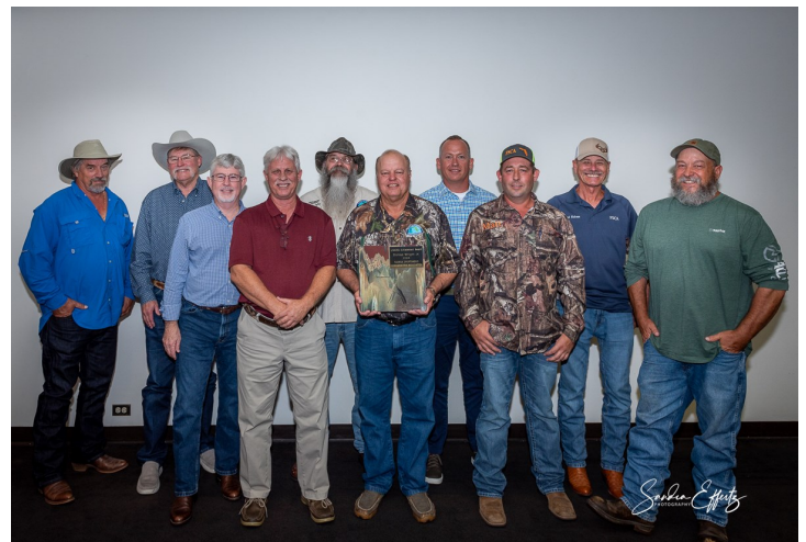
Current and past presidents of FSCA