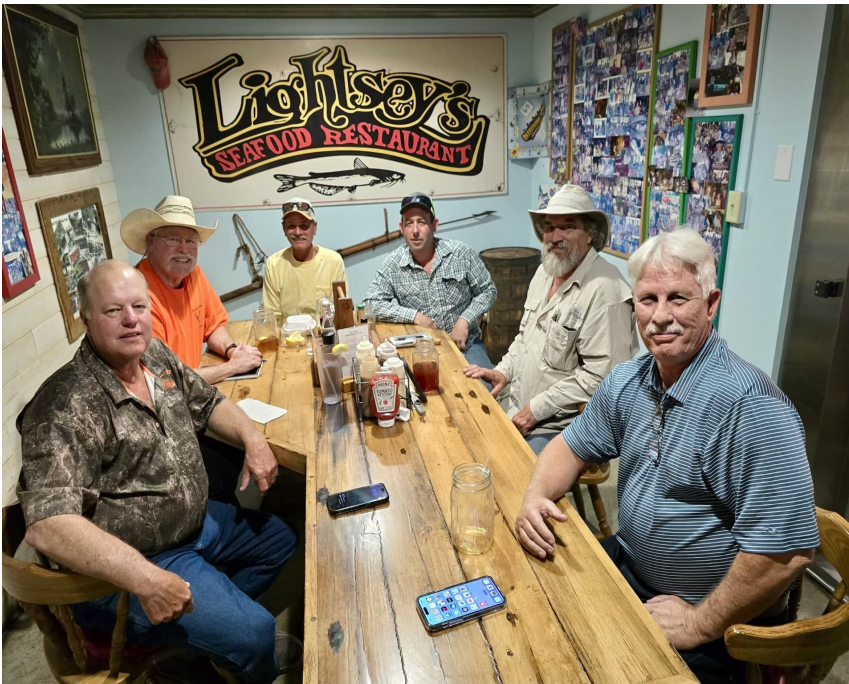
6 Presidents from 1994 through 2024

The Florida Sportsmen's Conservation Association 30th Reunion is a memorable event for past presidents, founding fathers, and other attendees. You can ensure a successful and enjoyable gathering celebrating the association's achievements over the past 30 years.