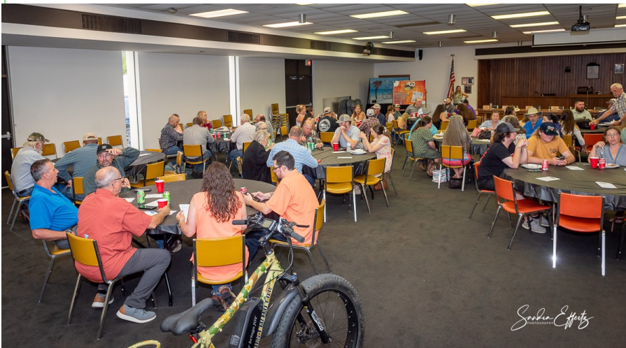
FSCA 30th Reunion Pictures by Sandra Effertz Photography